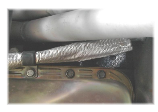
Tri-y headers shown here with the cable too close.

THE CABLE <u>CANNOT</u> TOUCH THE EXHAUST. ANY CABLE DAMAGE FROM EXCESSIVE HEAT WILL NOT BE WARRANTIED!!